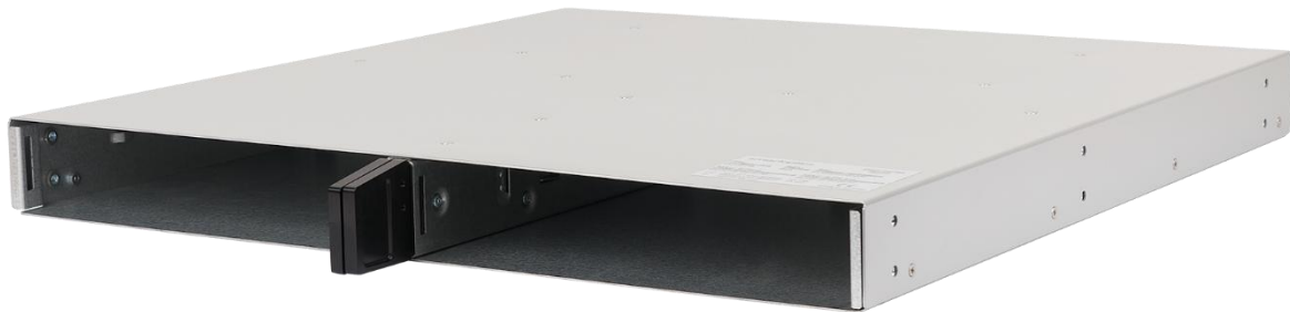
DCP-2 + DCP-F